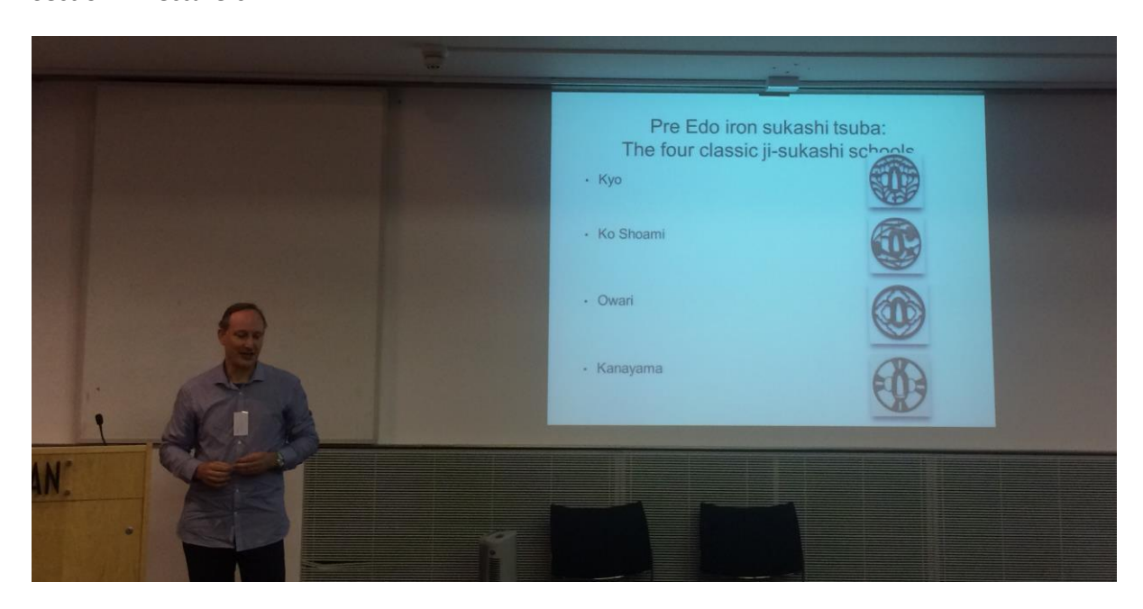
Section 1: Lecturers